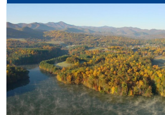
View the Blue Ridge Mountains.

Day 4: Today after enjoying a Continental Breakfast, you depart for home... A perfect time to chat with your friends about all the fun things you've done, the spectacular sights you've seen and where your next group trip will take you!