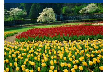
One of the Biltmore's many gardens.