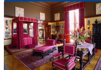
Grand Victorian architecture.