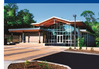
The Blue Ridge Parkway Visitor Center.